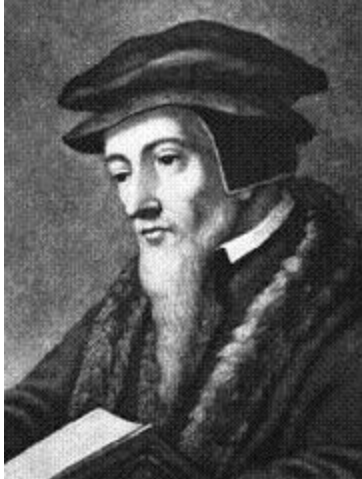
John Calvin, a major figure of Reformed Theology.

Reformed theology, whose greatest representative is John Calvin, joined the Lutherans in teaching the three solas of Protestantism. Sola Fide (Faith alone) means that we are never justified by works. Sola Gratia (Grace alone) means we can never do anything to merit God's acceptance. And Sola Scriptura (Scripture alone) means that no beliefs are necessary to accept unless they are in the Bible. At the center of Calvin's theology is "adoption," which means God elects to make some people his children by the grace of Christ. What is new in Calvin's doctrine of predestination is that believers can and should know they are among the elect, predestined for salvation, so they can be certain even in this life that they are already saved for eternity.