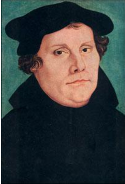
Martin Luther: Father of the Reformation.

Protestantism begins with Martin Luther's theology, which is based on the distinction between Law and Gospel. That is, between the Word of God which commands sinners to do what they cannot do; and, therefore condemns them, and the Word of God which promises Grace to sinners and gives what it promises? We are justified by faith alone apart from works of the Law. Because the Gospel is the promise of Christ, it provides a basis for certainty that God is gracious to sinners like us, which Luther could not find in other forms of medieval piety.