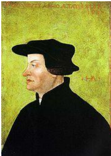
Huldrych Zwingli, reformer and the early Anabaptist.

In terms of theology Luther and Calvin often in disagreement, but Calvin's theology was a major impetus in the development of the Protestant forensic doctrine of justification. What this means is that God declares sinners righteous when they believe. Think of the line from the hymn Amazing Grace , "How blessed did that grace appear the hour I first believed." And you can better grasp the concept. For all Protestant theologians, the foundation of all the benefits received by faith is union with Christ. At this time I want to move on to yet another group that emerged during the Reformation the Anabaptists.