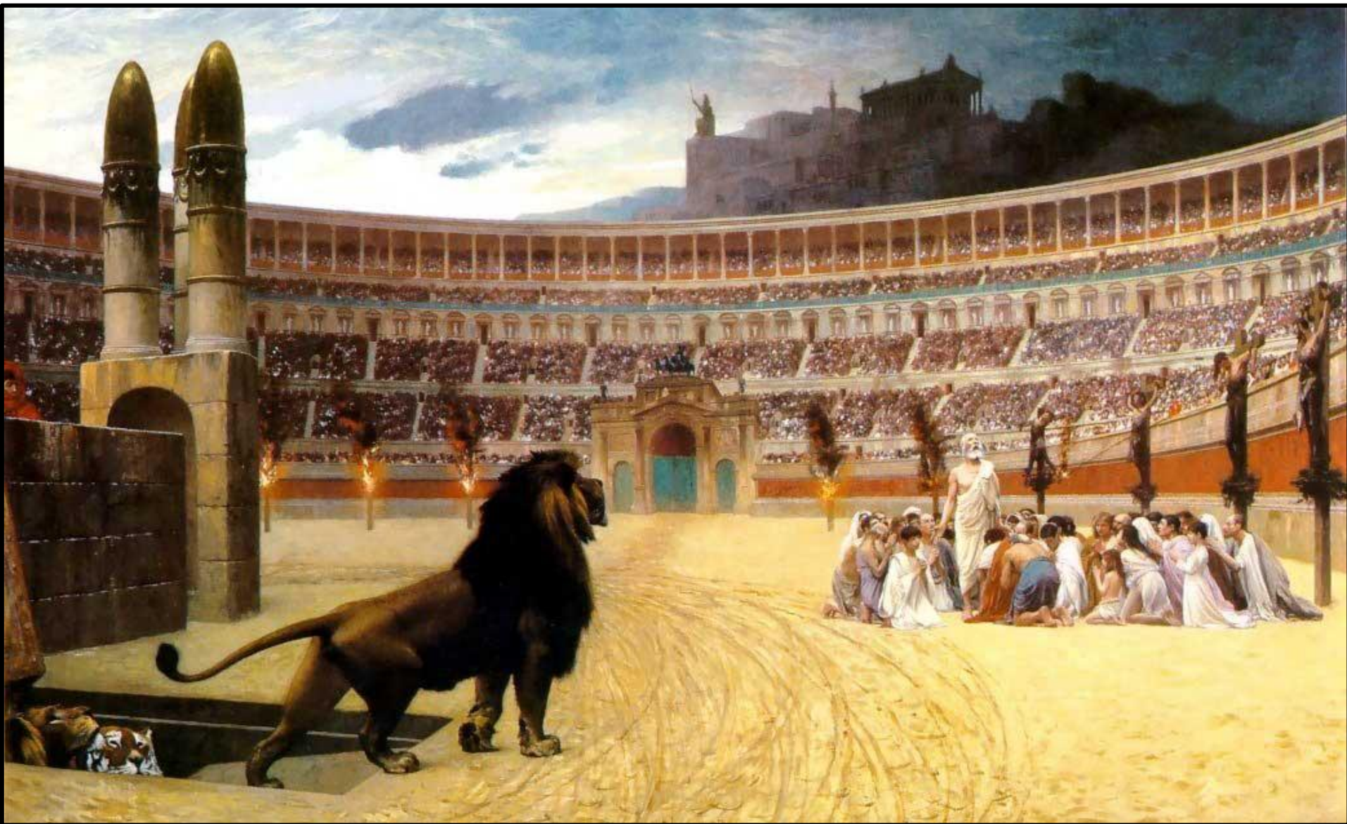
“The Christian Martyrs' Last Prayer” by Leon Gerome (1824–1904)